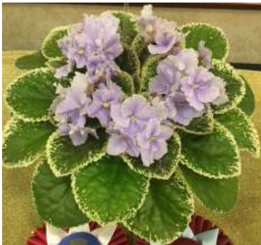
Buckeye Nostalgia 2 nd Best in Show, DAVS 2018 By Kurt Jablonski

Here is expert advice from top growers on grooming. An African violet grown by a "good groomer" will be more symmetric, cleaner and score higher in show than a plant grown without a grooming regimen.