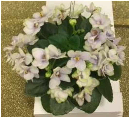
Jolly Orchid Best Miniature