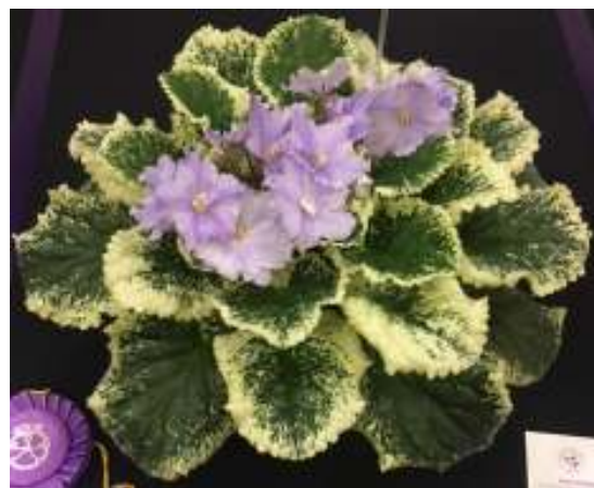
Buckeye Northern Lights by Kurt Jablonski DAVS 2018 Birmingham Show

October 13-14, 2018 - Fall Plant Festival, USF Botanical Gardens, 12210 USF Pine Drive, Tampa, FL 33612. http://gardens.usf.edu/