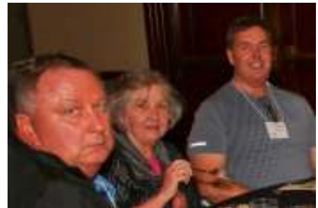
2018 Birmingham Convention