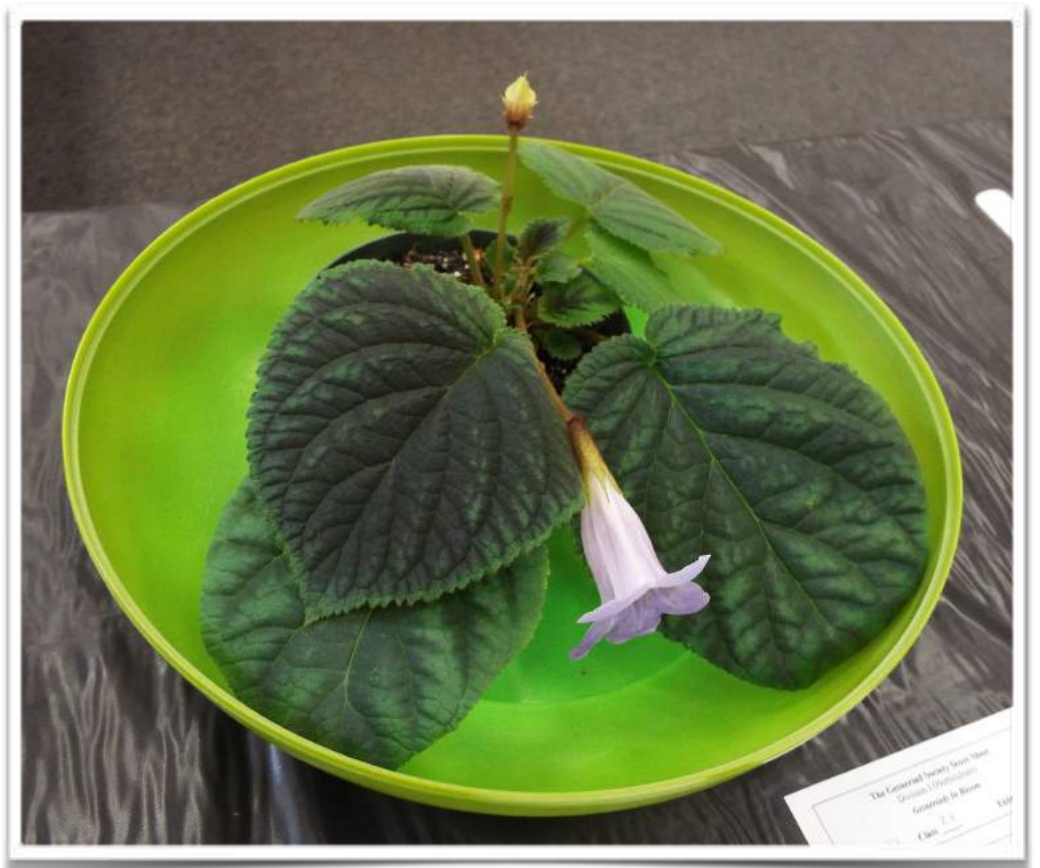
Henckelia speciosa